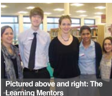
Pictured above and right: The Learning Mentors