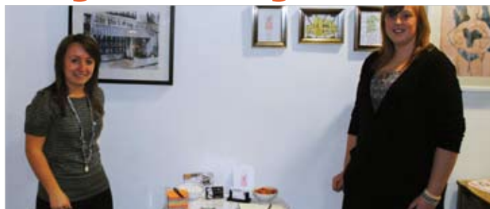
Art and design students organised a week-long Young Designers@Sixth exhibition at FYCreatives in Blackpool in the run-up to Christmas.