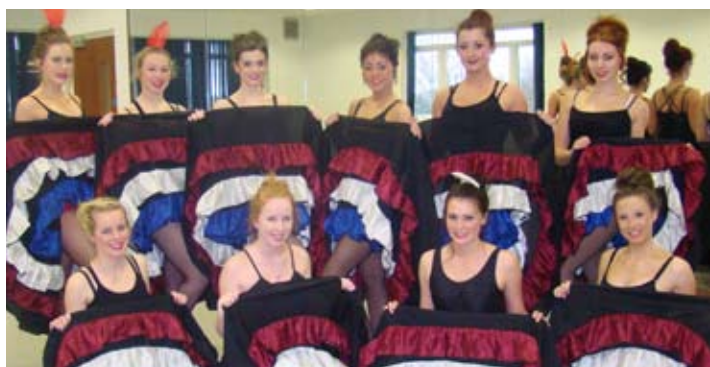
Performing Arts students took part in the Blackpool Festival of Dance in December at the Winter Gardens. The students performed a traditional Cancan in keeping with the theme for this year's festival which was 'Variety Performance and Musicals'.