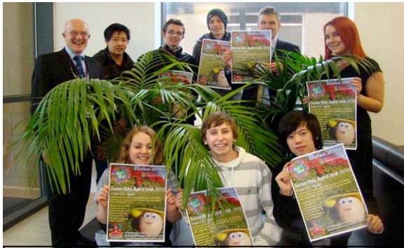
In the jungle- Students take on the challenge of organising EcoFest!

On April 3 rd 2010, the college held EcoFest, a celebration of all things environmentally friendly which helped raise awareness on climate change and environmental issues.